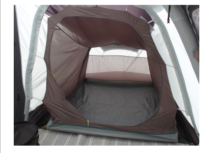
10. Peg out all the guylines around the annexe to ensure it is secure.

9. Lay the inner tent in the annexe and start at the back by clipping the 'c' clips to the floor and matching the coloured elastic with the coloured loop.