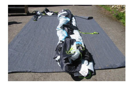
2. Measure the width of the bag up against the width of the folded annexe to make sure the annexe is going to fit.