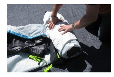
4. Place the rolled annexe on to the bag and pull the sides up round it. Finally, zip up the bag.

1. Fold the annexe lengthways from the opposite ends to the valves to push all the air out. Make a long thin sausage shape.